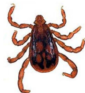
Brown Dog Tick Rhipicephalus sanguineus An indoor species. It can survive outdoors during the summer.