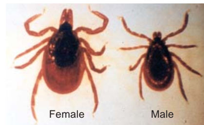
Black legged Tick (enlarged to show detail)

Note: Seventy percent or more of all Lyme disease cases occur from the bite of ticks in the nymph stage.