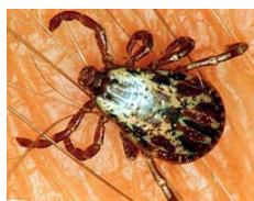
American Dog Tick Dermacentor variabilis (Vector of Rocky Mountain Spotted Fever) The largest tick found in New Jersey. Solid brown with mottled white dorsal shield. Oblong in shape.