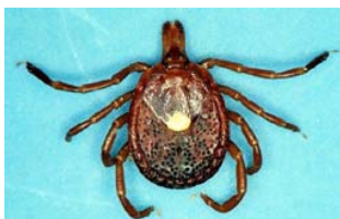
Lone Star Tick Amblyomma americanum (Vector of "Lyme-like" disease; H.M. Ehrlichiosis) Common south of Freehold, New Jersey. Very fast and aggressive. Red brown in color, tear drop shaped.

(greatly enlarged drawings of adult females)