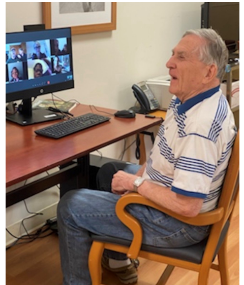
Virtual Visit with the Herman's.