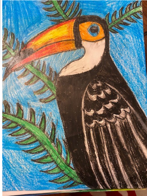
Thank you to the students of Lincoln Park Elementary School for providing these works of art to make our residents smile!