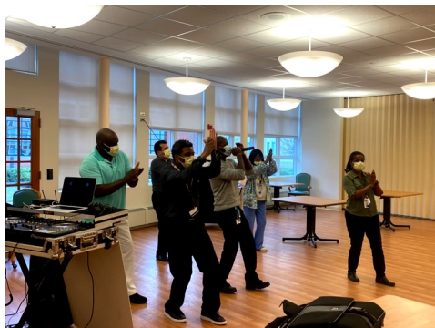
DJ Dance Party via LIVE FEED through Channel 64! (in-house station)