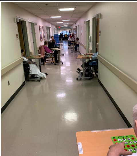
Hallway Bingo brings smiles to players on 1-300.