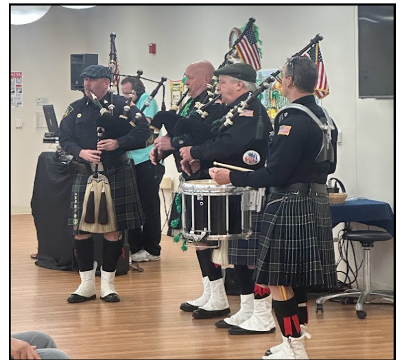
(L to R) Trip to the 4th Annual 2023 Totowa, NJ Car Show and Sheriff's Department Bagpipers Corp. visit on St. Patrick's Day.