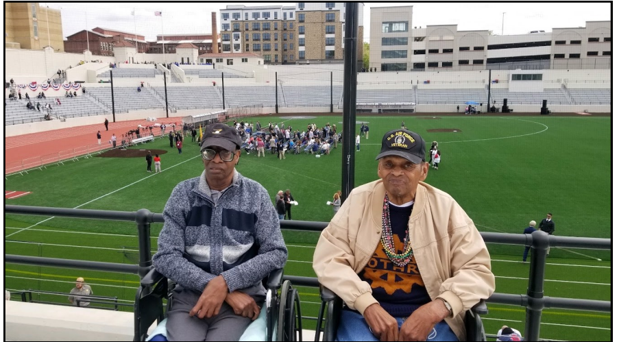
(L to R) Meadowland Racetrack Trip & Ribbon Cutting Ceremony for the reopening of The Historic Hinchliffe Stadium.