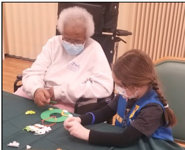
Craft project visit with Girl Scout Daisy Troop #98485